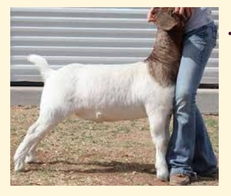
The show arena at LTHS Ag Facility is always open. NO CHARGE